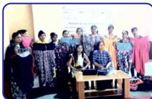
Women Empowerment Project