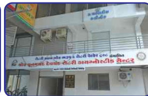
P.D. Shroff Rotary Diagnostic Center