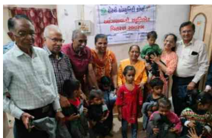
Distribution of sweaters to the students of the Maktampur Anganvadi.

Distribution of kites, Chikki & Snacks to the childrens of children home for boys at kali Talavdi.