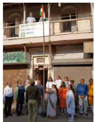
Celebration of the Republic day at Juna Bazar Library.

Tribute to Mahatma Gandhi on the day of Mahatma Gandhi Nirvan Diwas.