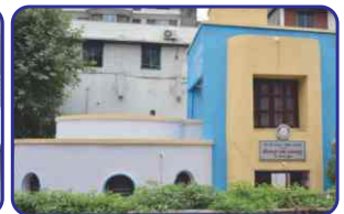
Pay & Use Toilet Blocks