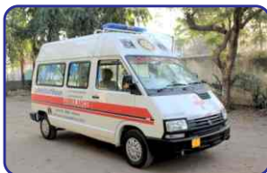
Ambulance & Morgue Vehicle