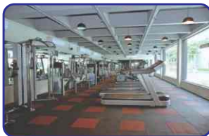
M. I. Patel Rotary Youth Center