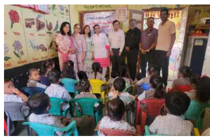
Distribution of sweaters to the students of the Limdi Chauk, Mahmadvura Anganvadi.

Homeopathy & Ayurvedic Medical Camp (A y u s h M e d o) at Swaminarayan Temple, Dandiya Bazaar.