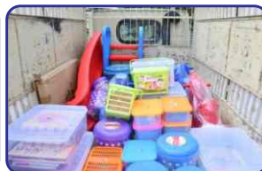
Mobile Toy Library - Ramakdu